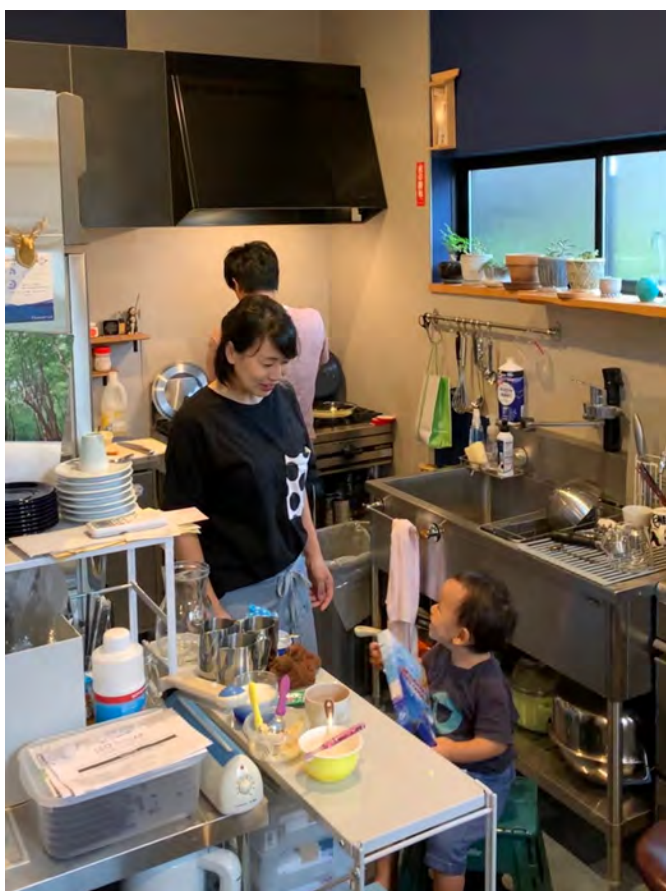
Fig. 22 Quiet time in the morning for the young Kawasaki family who own and manage Francoile, a boutique hotel and café they designed and built in Honmura, Naoshima.

Among the islands, contemporary art and cultural tourism on Naoshima is probably the most developed, from art museums to art-sites and guerrilla art. On the island, there are three types of bus services: one for the locals, one for everyone but with priority given to the locals, and one for Benesse House guests only. At the local izakaya, I asked some of the older islanders if they have been to the museums and they all replied no. One woman said, laughing, that she would not enjoy it at all as she would have to keep quiet or whisper in the museum! The original islanders' attitudes towards non-islanders can be ambivalent and complex as well. While they are generally supportive of the economic boost from the art activities, they tend to be less enthusiastic about “outside” people settling down permanently.