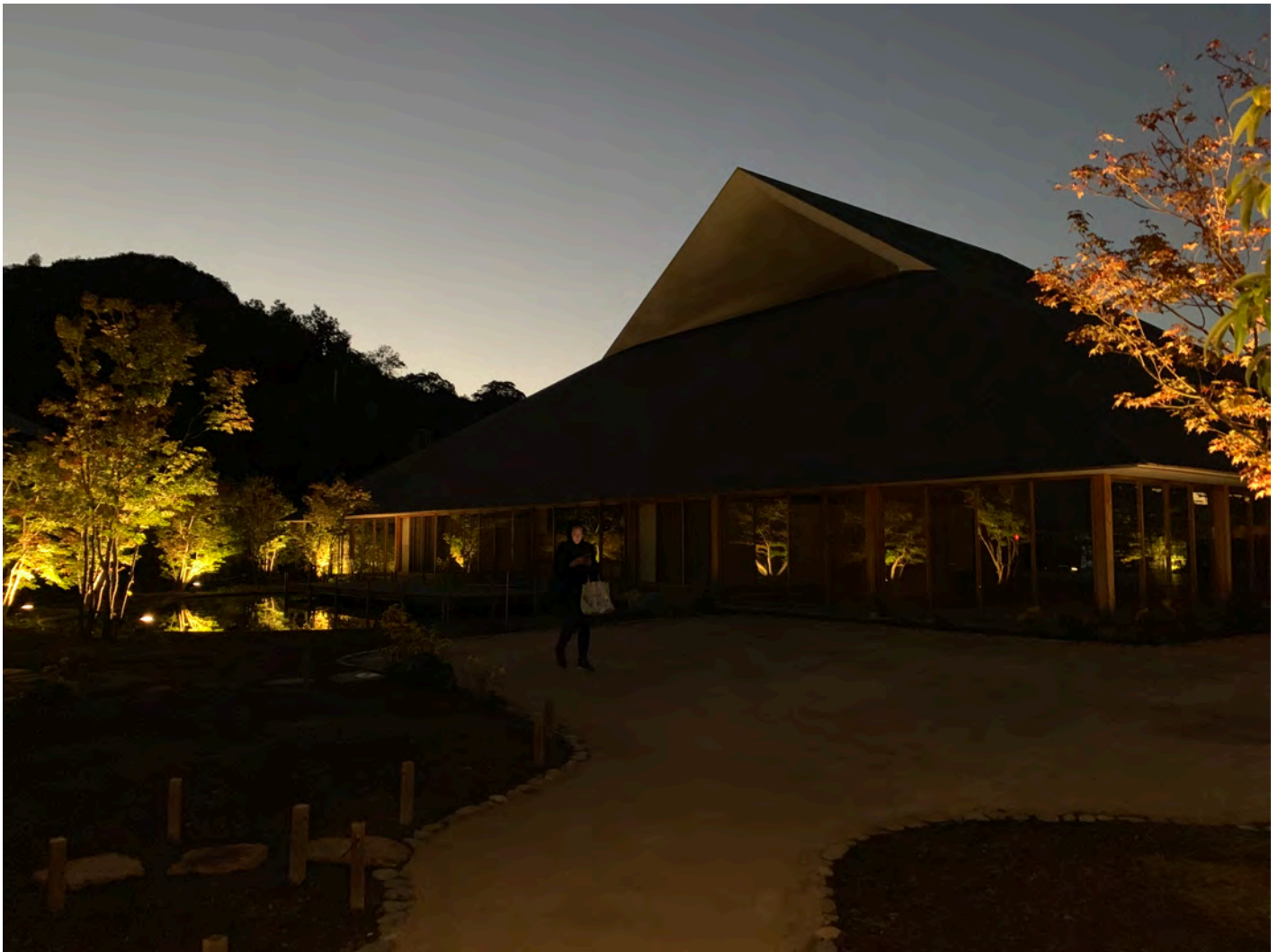
Fig. 30 Evening in Naoshima Hall. The town hall designed by Hiroshi Sambuichi, opened in 2016.

The most significant physical impact on the contemporary visual landscape is through major architectural additions/commissions. These include not only the major museums and large-scale art installations, but also public projects like the Naoshima town hall designed by Hiroshi Sambuichi and selected smaller design projects by commercial or private owners. The latter are still relatively rare as land is not easy to purchase on the islands, as mentioned earlier. Nevertheless, these subtle renovations have helped to reshape the contours in the built environment and also transformed the island experience where/when they are open to public access because of tourism activities. Experientially, the major Benesse art museums on Naoshima, Teshima and Inujima have already fundamentally transformed the visitor's experience by mediating the islands through Japanese modern architectural aesthetics. The interiors of many old houses have also been transformed by artists' works, creating unexpected and unique experiences for visitors.