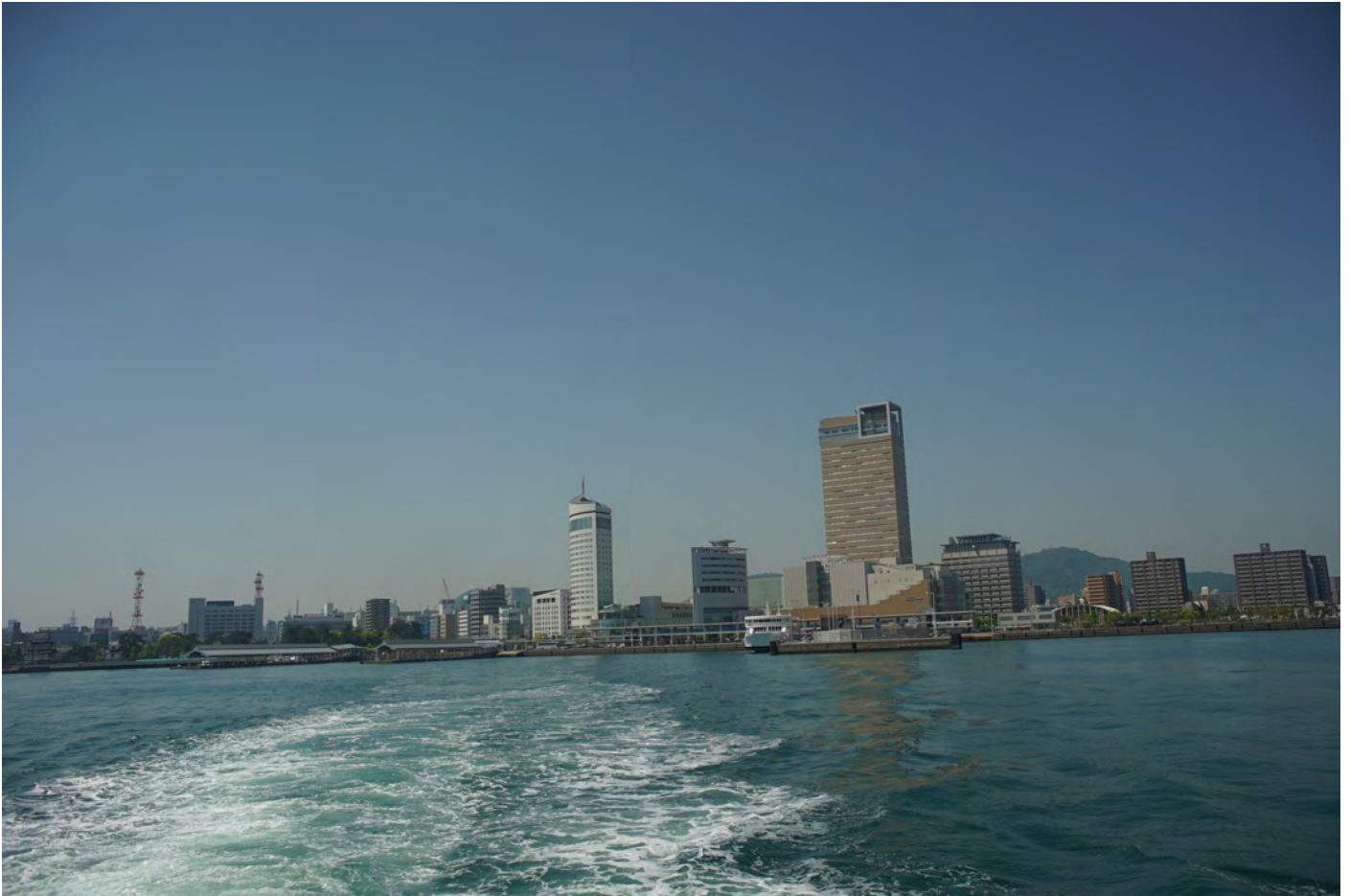
Fig. 44 View of Takamatsu port town from boat headed towards the islands.

Although it has only been around three months since I left Japan in January 2020, the COVID-19 pandemic has changed the world. I wonder whether I will still recognize the places I visited and the people I met when I return to Japan. Even in the six months I was there, in the run-up to the postponed Tokyo Olympics, the urbanscape was already transforming; smaller art spaces in Tokyo were being pushed out of the city centres and some, like Vacant in Harajuku, closing for good. The Aichi Triennale's censorship controversy had also brought things into sharp relief. From festivals to museums, the growing volume of right-wing political protests encroaching into the contemporary art sphere could no longer be ignored. The virus has also revealed the cracks in social structures, showing how the inequalities or injustices borne by the less fortunate are ultimately everyone's burden to share. In that sense, the research at Setouchi seems more urgent and relevant than ever. While the future remains uncertain, change can also clear the space for better things to come.