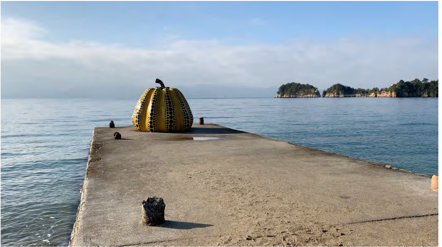
Fig. 15 Yayoi Kusama, Yellow Pumpkin (1994), site-specific installation, fibreglass, 200 x 250 cm, Naoshima.