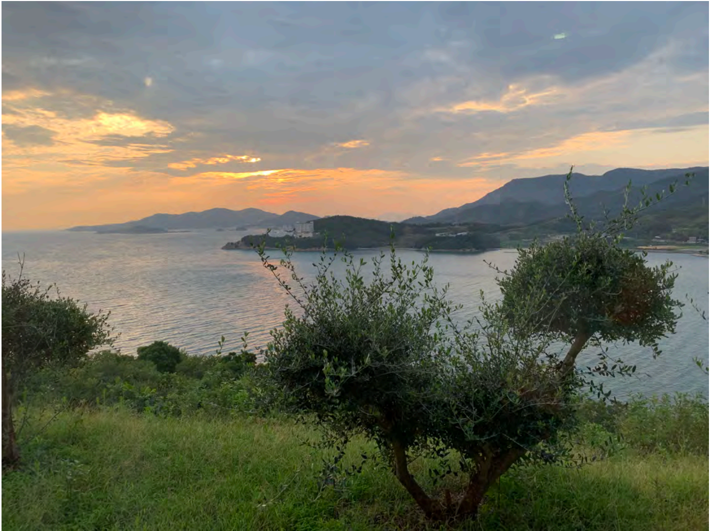
Fig. 27 View of the Seto Inland Sea from the Kokuminshukusha Shodoshima, the national hotel popular with domestic tourists and business travelers.

decade. In 2019. There were an estimated 31.88 million visitors, with more than half arriving from China, Taiwan and Hong Kong – the same countries that make up the highest proportion of Koebi-Tai volunteers. The curatorial framework for the Setouchi Triennale has focused on introducing and developing patronage of contemporary art towards the development of new cultural tourism economies. At the Setouchi Asia Forum, Kitagawa even drew parallels between visiting contemporary art on remote islands to religious sites and rituals that had drawn pilgrims to travel through Japan in past centuries.