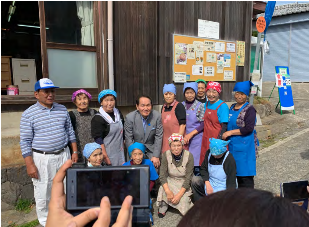
Fig. 24 The mothers of Ibukijima who set up “Urara Kitchen” pose for a photo with Keizō Hamada, the governor of Kagawa prefecture. Urara Kitchen mothers prepare bento sets to showcase Ibukijima’s famous iriko (small sardines) for Triennale visitors.

Benesse Foundation’s primary recruitment takes place in Tokyo and many of the museum employees are not from the region. Among the Koebi-Tai volunteers, the highest number of international volunteers comes from Hong Kong, followed by Taiwan and China. Based on my conversations with people working on Naoshima, Teshima and Shodoshima, the original islanders are especially resistant to selling land and property to outsiders who are not from the islands. In that sense, I imagine that it is not so easy to encourage people to settle down on the islands and imagine a long-term future.