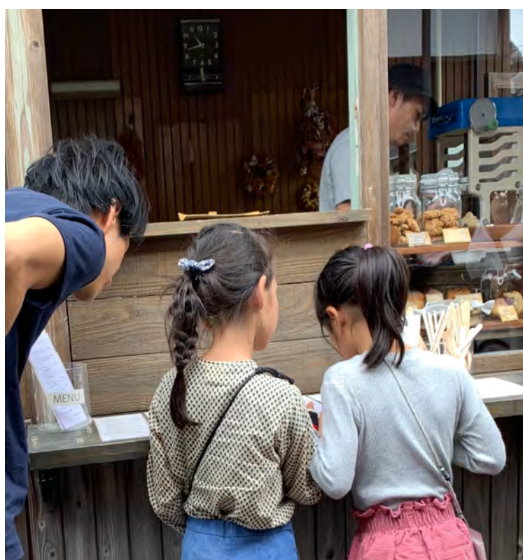
Fig. 34 New pop-up kiosks on Naoshima opened by young people newly moved to the island.