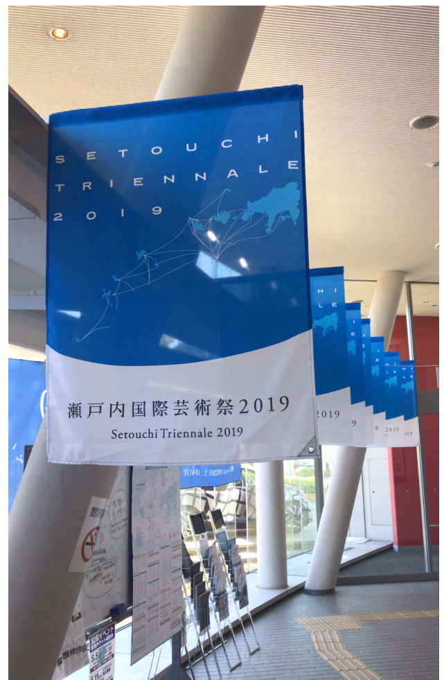
Fig. 1 Setouchi Triennale Information Centre in Takamatsu Passenger Terminal Building.

Visitor numbers to the Setouchi islands have increased exponentially over the past decade, thanks to the publicity efforts of the Setouchi Triennale team. In 1990, there were less than 10,000 visitors. In 2019, an estimated 1,178,484 visitors, from Japan and abroad, visited the triennale. Works were shown across 12 islands and two port cities, Takamatsu and Uno. Notably, the latest edition incorporated more live and interactive elements, such as performances, film screenings, and food art events.