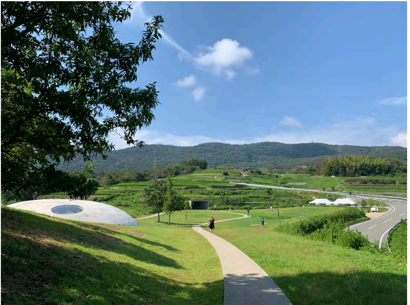
Fig. 4 The Teshima Art Museum, designed by architect Ryue Nishizawa and artist Rei Naito, opened in 2010.

While there is an undeniable sociological aspect to this project, the contemporary artworks and projects remain the primary focus of this study. This project is situated in the nexus between the discipline of art history and contemporary curating as practice. As such, formal visual analysis and other art historical approaches to studying key artworks will be important. As a number of the durational art projects involve participatory work or social engagement, sociological and anthropological techniques such as formal and informal interviews, and participant observation were deployed. Moving forward, the research data collected about people, sites, and structures during the fellowship period will be analyzed in relation to the selected artworks that have been evaluated as suitable for further in-depth study.