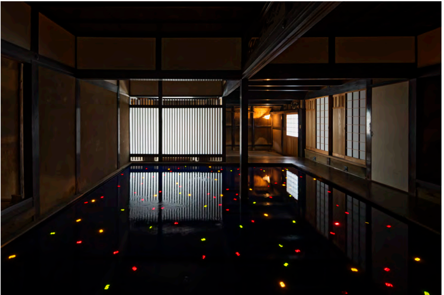
Fig 3 Tatsuo Miyajima, Sea of Time '98 (1998), plastic coated waterproof light emitting diode, IC, electric wire, water, FRP water pool, 486 x 577 x 15 cm. Art House Project "Kadoya", a site-specific installation in a 200-year old house on Naoshima.

Benesse Foundation, had tried to track down all the original participants, it was inevitable that some of the older ones had passed on, others had moved away or wanted to transfer their 'right' to another family member.