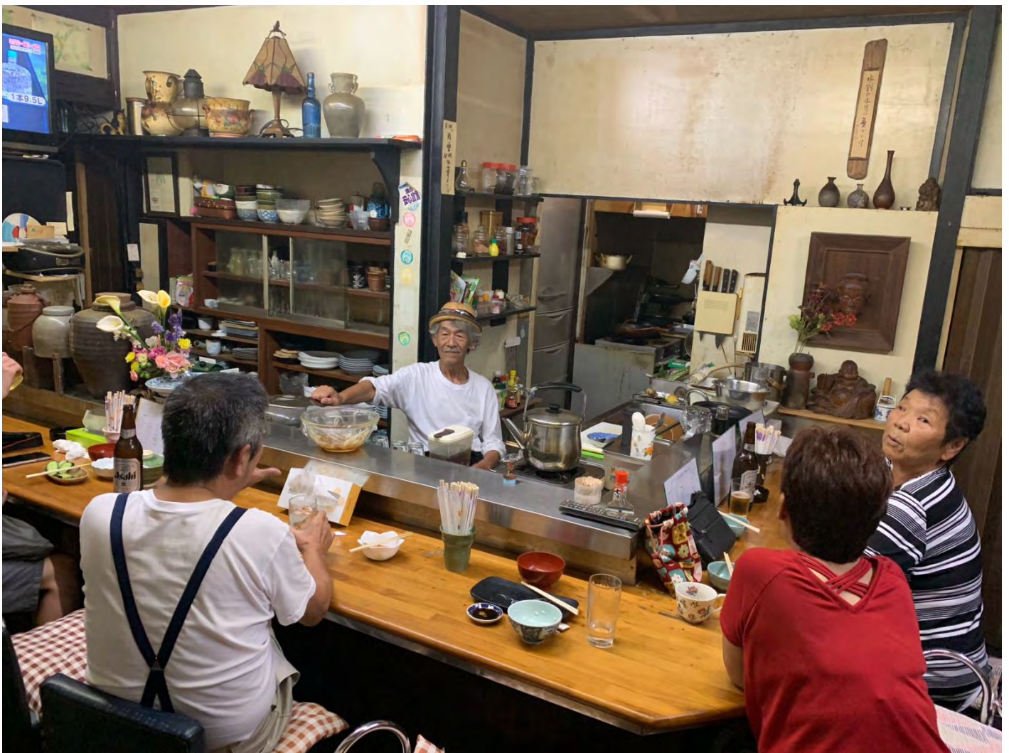
Fig. 21 Regulars gathering at the end of the day for drinks and conversation at their local izakaya in Miyanoura, Naoshima.

The opening of the Benesse House Museum on Naoshima in 1992 was not immediately welcomed by the local people. The building of the museums on Inujima in 2008 and Teshima in 2010 also faced resistance from the local residents who had a bad experience with the earlier exploitation. Town-hall meetings had to be conducted with them to ease their misgivings before the projects went ahead.