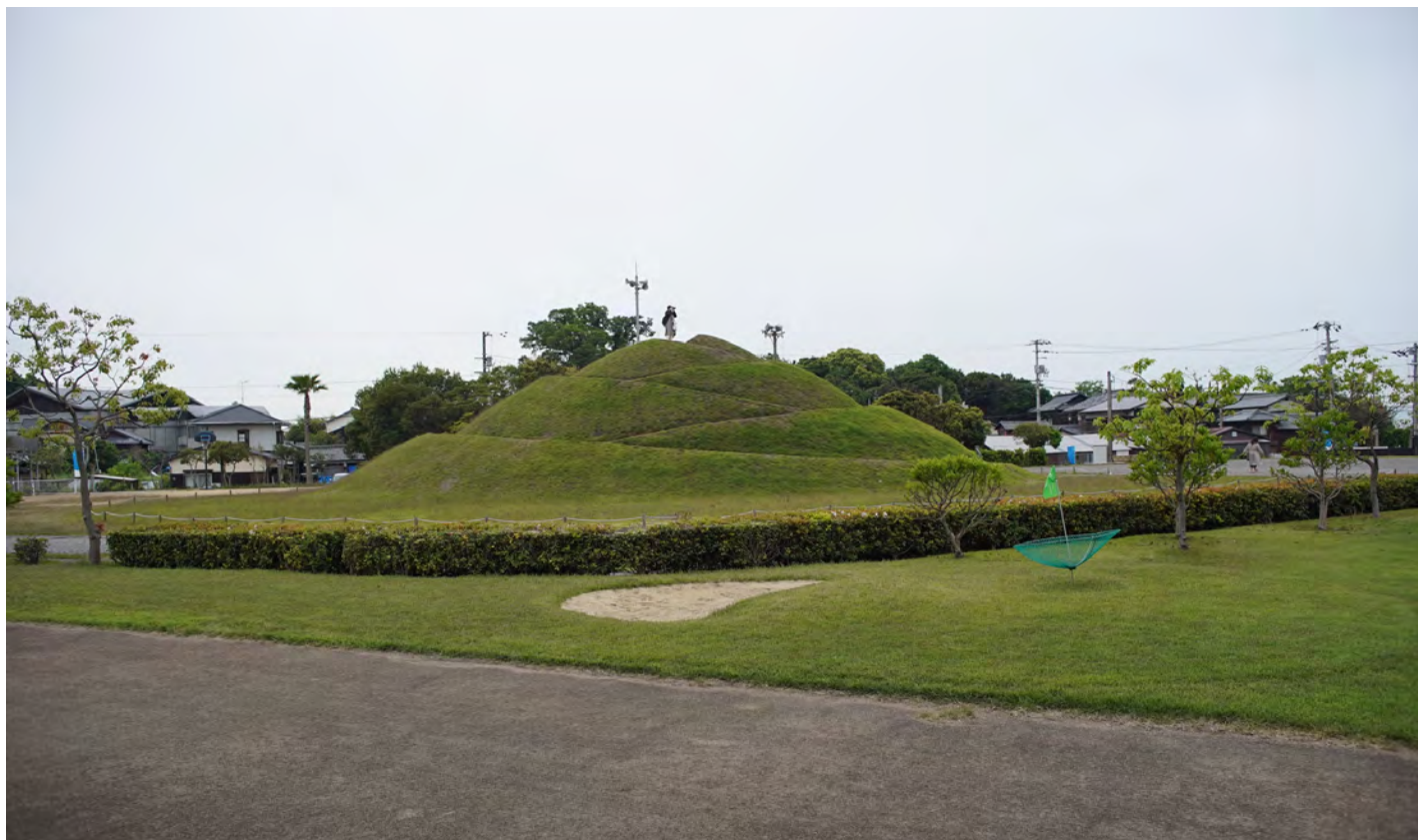
Fig. 11 Tanya Preminger, Stratums (2013), site-specific installation, earth and grass, 6.5 x 28 x 18m in Shamijima.