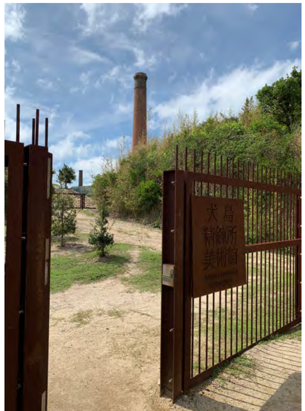
Fig. 10 Inujima Seirenscho Art Museum on the site of a former copper refinery.