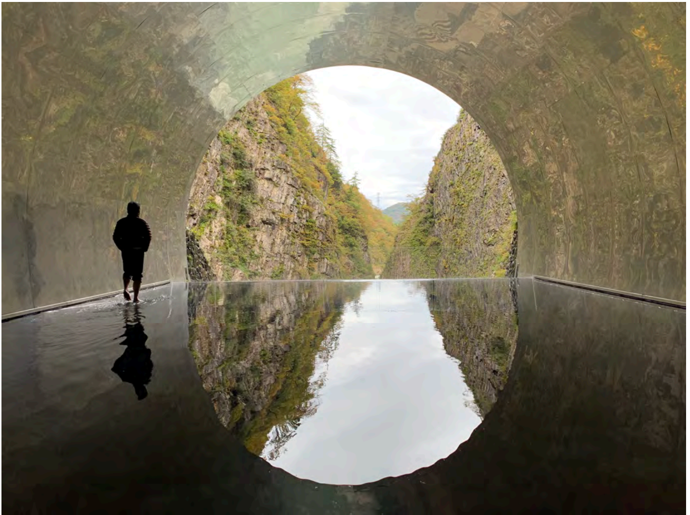
Fig. 46 MAD Architects (led by principal Ma Yansong), Tunnel of Light (2018), site-specific architectural intervention in the Kiyotsu Gorge, part of the Echigo-Tsumari Art Field in Niigata.

in landfills – that could help in coming up with recycling or upcycling solutions that could mitigate the environmental impact of cultural tourism on the islands. The Ministry of Land, Infrastructure, Transport and Tourism, Japan, published a useful short report in 2014 titled “Case Study – Contemporary Art and Tourism on Setouchi Islands, Japan” (OECD, 2014) that briefly discusses cultural tourism in Setouchi as a success story. An updated cost-benefit study and analysis of the environmental impact could include calculating the carbon footprint from the extensive air and sea travel undertaken not only by visitors but also by artists and volunteers from abroad.