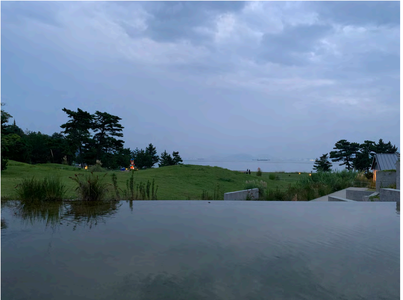
Fig. 17 View of Seto Inland Sea from Benesse House, Naoshima.

The future development of this research project is situated within a broader global discourse about ethics and sustainability in the age of the Anthropocene. In that regard, I would like to mention a couple of references for my study: Jedediah Purdy's After Nature (2015) and Rob Nixon's Slow Violence and the Environmentalism of the Poor (2011). Nixon has defined slow violence as "a violence that occurs gradually and out of sight, a violence of delayed destruction that is dispersed across time and space, an attritional violence that is typically not viewed as violence at all" (Nixon:2). Nixon has argued for the urgency of keeping our attention on the crises of slow violence at a time when it is easy to be seduced and distracted by the visual spectaculars playing out in the media space (COVID-19 patients dying without ventilators for example.) In relation to this research, the study of the Setouchi Triennale's impact on Oshima, for example, has brought the tragic history of