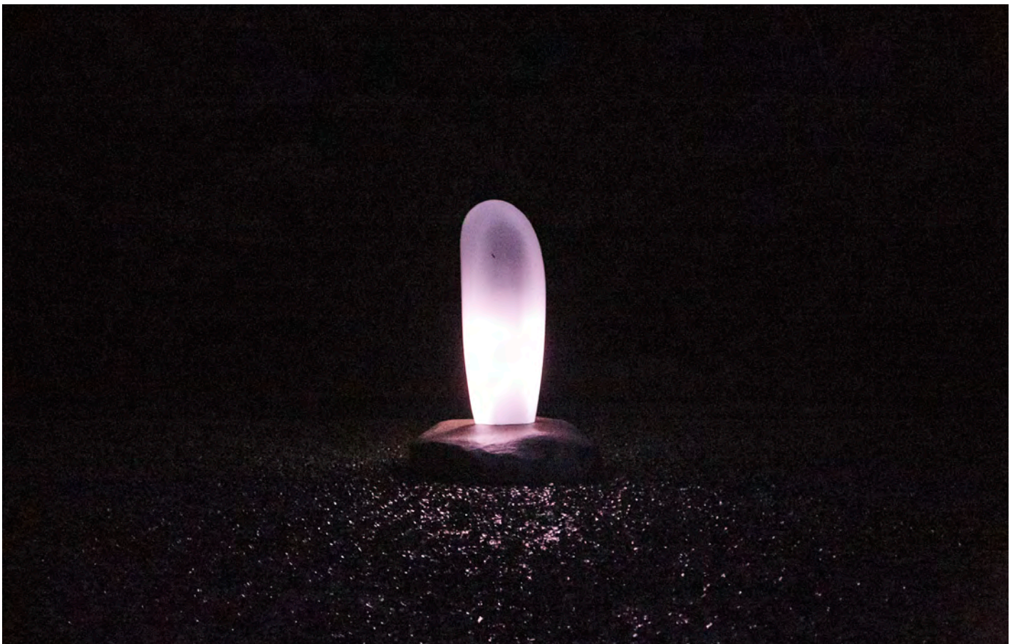
Fig. 32 Mariko Mori, Tom Na H-iu (2010), site-specific installation in a forest in a clearing in Tonosho, Teshima. Only viewable on weekend evenings during the triennale season.

The aim of the Setouchi Triennale is to revitalize the Setonaikai region through contemporary art. But what does it mean to revitalize and what is being revitalized? Which is the priority, the people or nature? Is ethical cohabitation possible? And what happens when a choice needs to be made that is beneficial to one and detrimental to the other? On the islands, the balance between people and nature continues to change. On Awashima, for example, the wild boar population has been increasing. These wild boars attack cultivated vegetable gardens and can also be dangerous to people at night. Some people have moved away from their mountain homes to the coastal areas, as it has become unsafe to live in sparsely populated areas. On Teshima, overnight bicycle rental is no longer allowed due to the risks of encountering wild boars. This made it challenging to view works in the evening, for example Mori Mariko's Tom Na H-iu (2010), which is situated in the middle of a forest clearing.