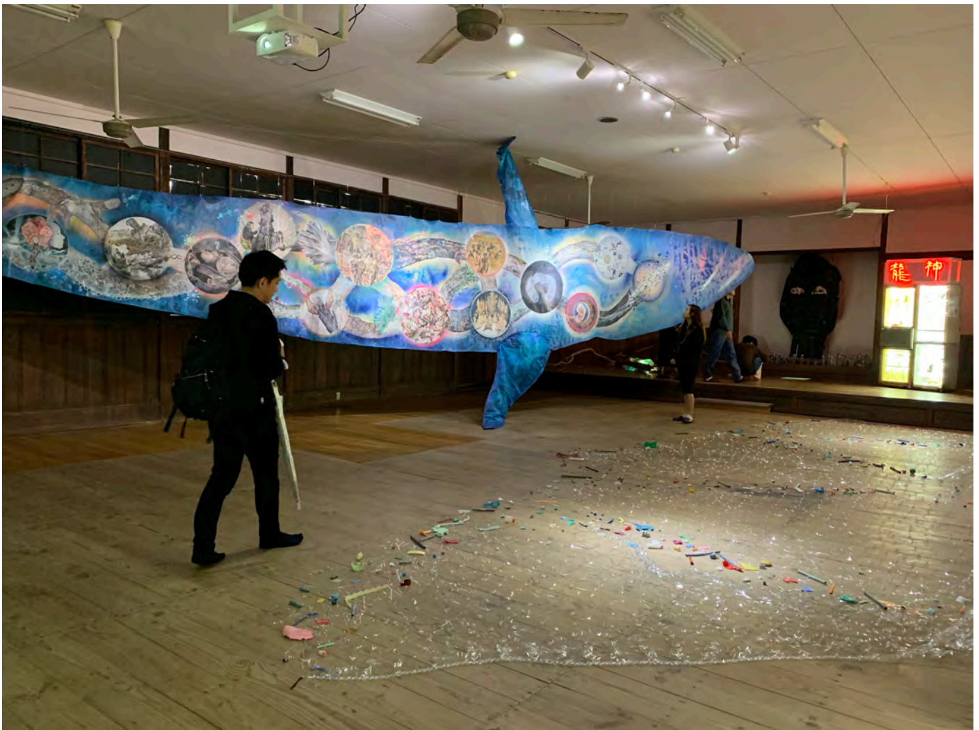
Fig. 43 Artworks installed inside the former maritime academy buildings on Awashima.

All these are questions that remain to be answered when considering the ecological sustainability of contemporary art on the Setouchi islands.