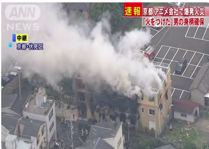
Fig. 6 Video still from news report “Dozens Die in Suspected Arson Attack at Animation Studio” (July 19, 2019)

Political friction has exposed chasms between different parts of Japanese society and also brought attention to underlying socio-political issues such as social alienation and economic disenfranchisement, both of which are more pervasive than previously thought. During my time in Japan, this was highlighted by two disturbing incidents that have had ripple effects within the Japanese art scene: the arson attack on the famous Kyoto Animation studio in July 2019 and the censorship of the Aichi Triennale in August of the same year.