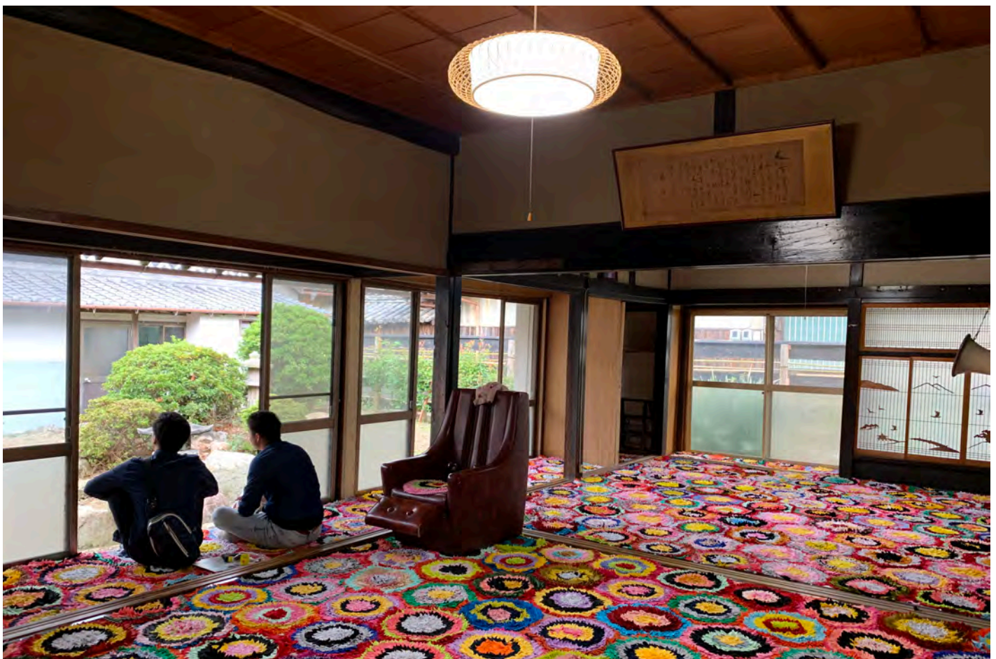
Fig. 38 Dinh Q. Le, A Bouquet for the Lady of the House (2019), site-specific installation, in a vacant house on Awashima.

Balancing between inclusion and depth of engagement is another curatorial challenge when trying to have as many islands involved as possible. Some islands have felt overshadowed by the more "popular" or larger islands. On Awashima, we found that some of the islanders were unhappy that their island seemed to only attract one-time day visitors. Some islanders even spoke about not participating in future editions. However, it is unlikely that the island was curatorially slighted as Dinh Q. Le, one of the most well-known international artists participating in 2019, presented a set of three works on Awashima. Furthermore, visitor numbers were high on the fall opening weekend that I was there, with an estimated 3,000 people per day. Still, such complaints speak to a longing for a different time when the islands had livelier inhabitation.