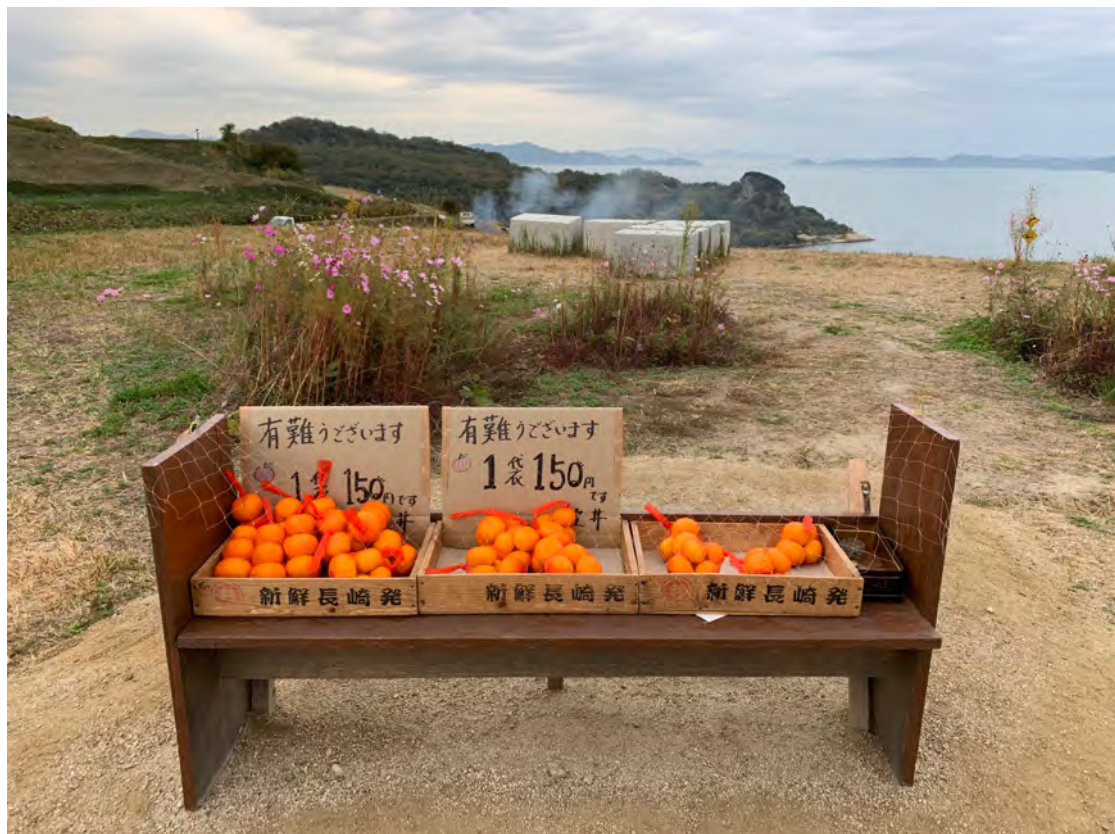
Fig. 25 Seasonal mikans left on a bench by a bus stop in Teshima. Pay-as-you wish with open cash box.

Although the islands are collectively referred to as the Setouchi Islands or Setonaikai, Shikoku, etc., each island community has its own unique history and geographical set of relationships in the region. Under the rubric of the Setouchi Triennale, there have been contemporary art initiatives that attempt to engage and negotiate with each community’s unique set of problems and issues, with mixed reception and results. Given the relatively small size of the islands and populations, it also seems unlikely that such efforts are indefinitely sustainable or can be scaled up for greater impact. In that regard, finding common identifiers may be necessary towards some broad-based solutions that are applicable across the board. Future impact studies of broad-based solutions could also be useful for comparative thinking and policy-making in other parts of Japan or even elsewhere in the world, particularly with regard to sustainable island ecologies.