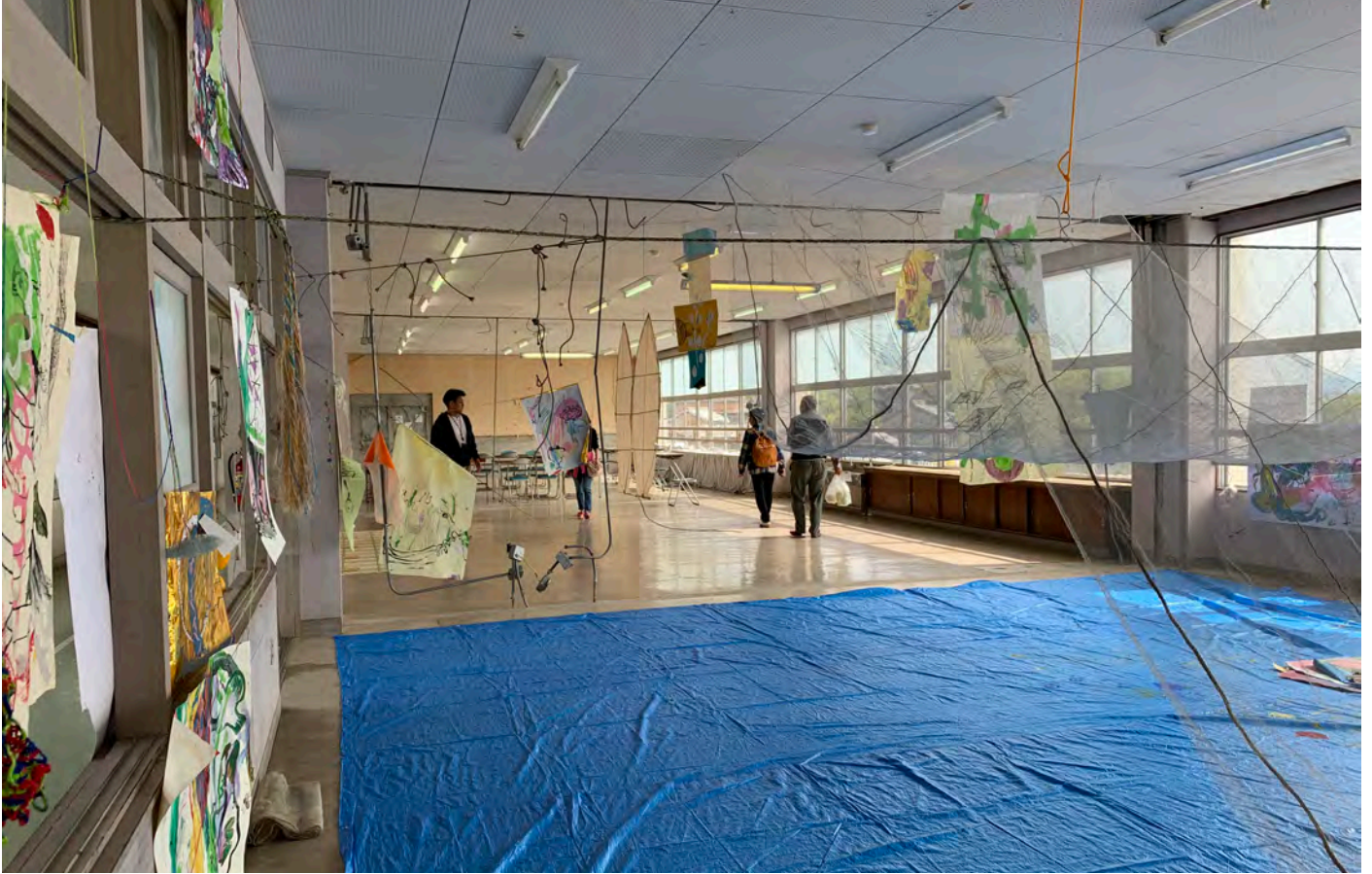
Fig. 35 Artworks installed in disused building of former elementary school on Ibukijima.

Curatorial ethics are a particularly important aspect of the Setouchi Triennial. This is due to the charged nature of certain exhibition components – notably the artists and volunteers’ engagement with at-risk communities – and the long duration of many programmes under its umbrella. Examples of these at-risk communities include the aging islanders, those living with the aftermath of toxic industrial waste dumping, and the residents of the Oshima sanatorium. This durational nature of certain projects have required a deeper engagement from both artists and the local people, allowed for greater impact in the long term.