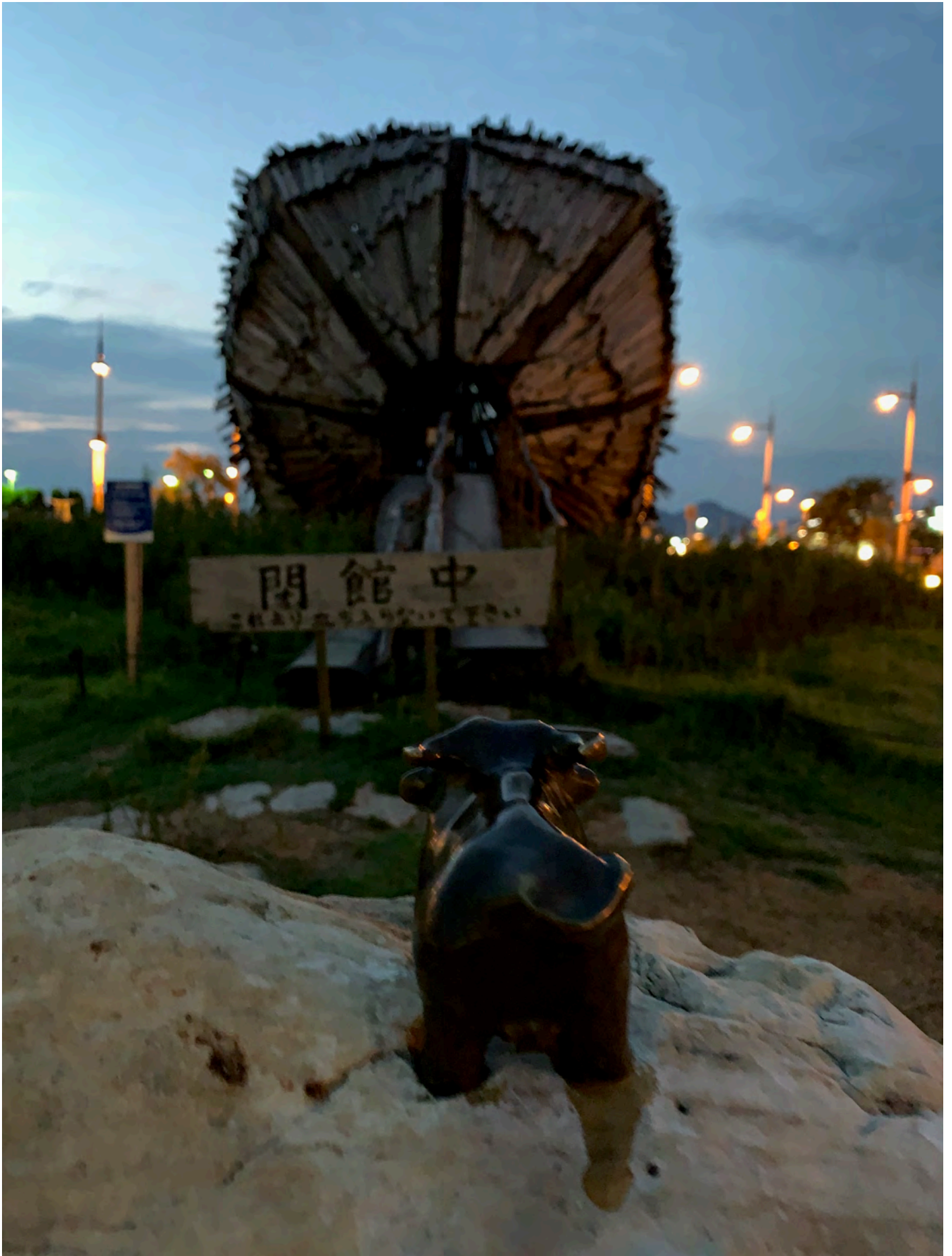
Fig. 48 Lun Shuen Long, Beyond the Borders – The Ocean (2019), sculptural installation, natural fiber, variable dimensions, in Takamatsu. Described as a traveling “seed ship”, this artwork was installed on a beach in Teshima for the 2013 triennale and moved to Takamatsu for the 2016 triennale and is now a permanent exhibit in the port town.