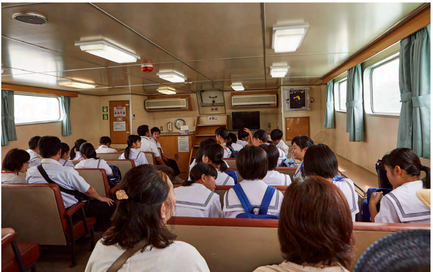
Fig. 40 Schoolchildren on the boat to Oshima.

The triennale volunteers and the visitors make up a significant presence during the festival but they are just a transitory population. The seasonality of visitors, even on the main art islands, is a concern for those involved with cultural tourism. A couple of Teshima islanders have noted that the triennale's effect in attracting visitors was more limited now as the main Benesse art islands of Naoshima, Teshima and Inujima do not have many new artworks, if any, for the triennale. The art-sites on these islands were mostly open year-round anyway so art tourists no longer had an urgency to visit during the festival. For the smaller islands, which lack food and accommodation options, it will continue to be difficult to attract visitors beyond the one-off day trips. Sparse transport is another big issue and affects everything from inter-island ferries and boats to intra-transport options such as cars and bicycles for moving around on the islands itself.