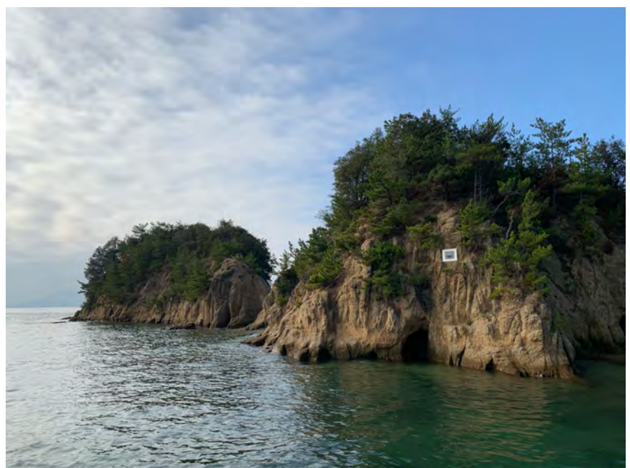
Fig. 29 Hiroshi Sugimoto, Time Exposed (1980-1997), a photo-based installation in the Benesse House Museum designed by Tadao Ando, opened in 1990, and on the cliff of a nearby rock formation.