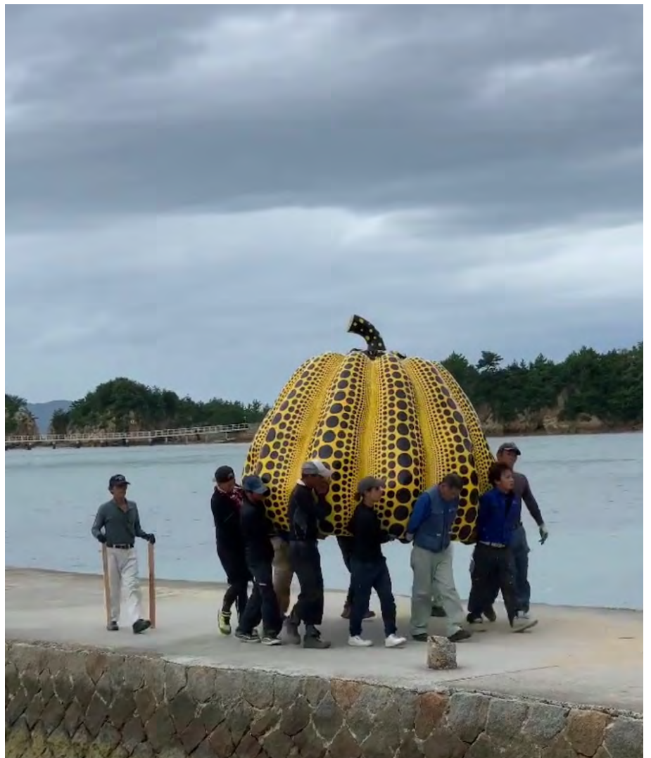
Fig. 16 Handlers moving Kusama's Yellow Pumpkin before Typhoon Krosa hits.