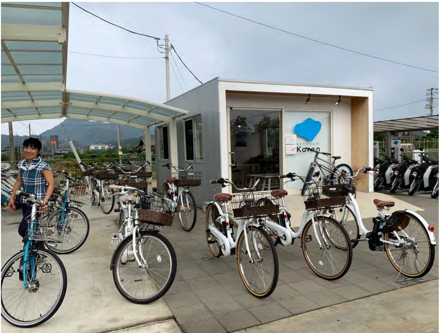
Fig. 14 Aikiko Yabuuchi, originally from Osaka, works at the Setouchi Karen bicycle rental shop on Teshima.

The problem of language and cultural interpretation proved to be a critical issue as it was essential to understanding the contexts for art production and audience reception on the islands. I gave careful consideration to finding suitable research assistants with good interpretation skills. This was tricky as I needed people who were effectively bilingual, in either English-Japanese or Chinese-Japanese, had some familiarity with contemporary art terminology, and had to be very comfortable with meeting and building up rapport with new people in unexpected situations. There were some islands where the locals still spoke with a strong dialect that was not readily understood by Japanese people from elsewhere. While most of the people who worked for the Benesse art museums or art-sites could speak English, not all were comfortable carrying out extended conversations. Many of the older locals who were born on the islands spoke only Japanese and it took some time to break the ice with them. Some people were kind enough to write to me after they had time to think over my questions. Aikiko Yabuuchi, one of the Setouchi Karen bicycle shop attendants on Teshima was one such example.