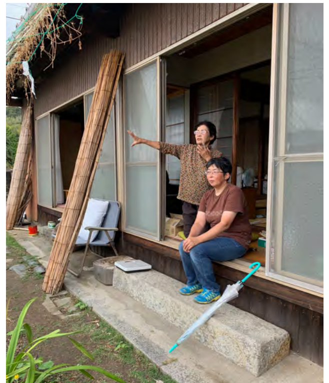
Fig. 20 Local islanders sharing stories of bygone days during a triennale weekend on Awashima.