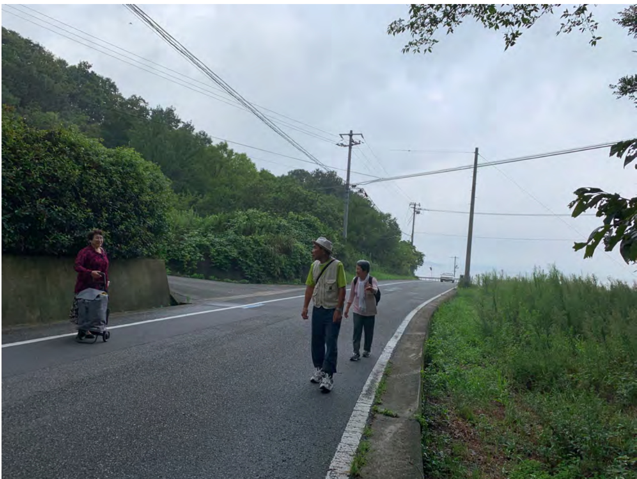
Fig. 33 A couple from Shodoshima making a day trip to Teshima for the very first time, stopping to ask for directions from a local passerby.

The infrastructure for tourism is, however, still relatively undeveloped on the islands, which have generally struggled to keep up with demand during the triennale season, especially the ferry and car rental services. Even so, some establishments have tried to resist ramping up business operations to cater to tourist demand since the triennale only takes place once every three years and only for six months. Among the islands, Shodoshima is probably the most tourist-ready, with its own government hotel and several car rental companies. Some islands are more committed to building up their cultural tourism industries. For last year's triennale, there were more accommodation possibilities on Naoshima and Teshima, with several small ryokans, hostels, and bed-and-breakfasts opening up online bookings in languages besides Japanese and listing themselves on Airbnb.