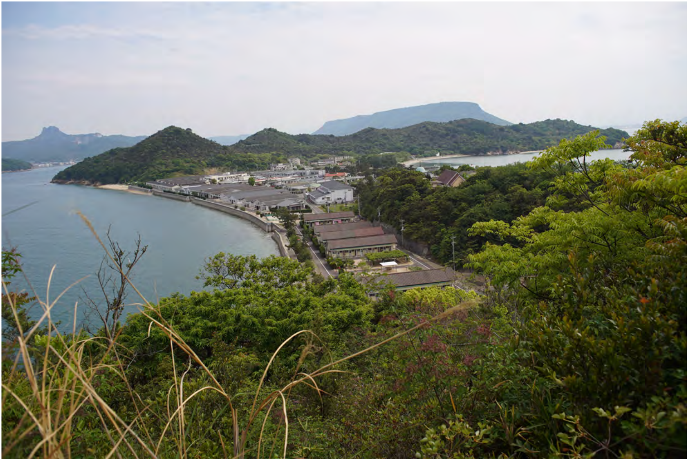
Fig. 18 A bird's eye view of the former Hansen's Disease patients' residences on Oshima.