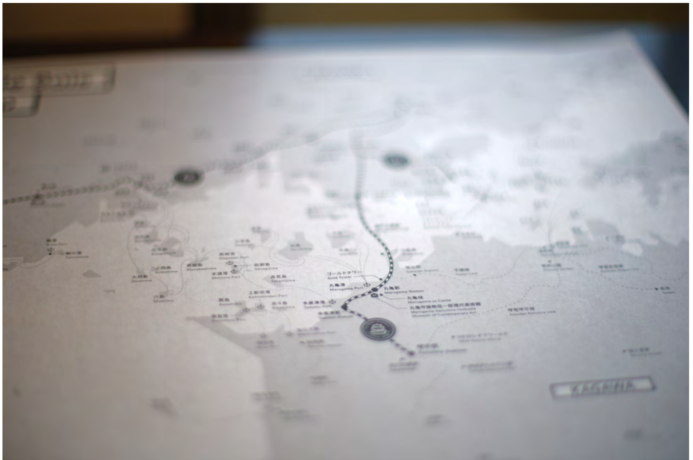
Fig. 47 Map view of the Setouchi region.

In the coming year, I intend to start presenting the research at conferences and to publish papers on selected issues in field-appropriate journals. I plan to return to Japan after the COVID-19 pandemic has subsided to carry out a final round of formal interviews, towards the publication of a book that examines the impact of contemporary art on the Setouchi islands.