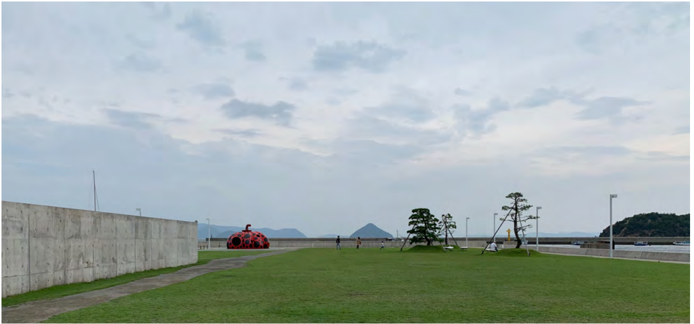
Fig. 2 Yayoi Kusama's Red Pumpkin (2006) in Miyanoura Port Square, Naoshima.