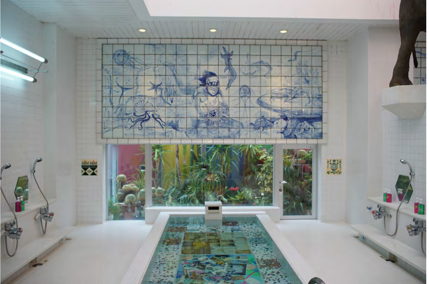
Fig. 26 Shinro Ohtake, Naoshima Bath I love Yu (2009), site-specific installation in a public bathhouse, Miyanoura, Naoshima.

The “Bilbao Effect” is often used to describe how the development of art projects such as museums, large-scales exhibitions, and festivals have transformed and rejuvenated the economies of fatigued cities. In Japan, the Yokohama Triennale has often been cited as a case study of how art exhibitions can stimulate a local economy. The impact of cultural tourism is usually expounded on in positive economic terms. Going beyond an increase of tourist dollars, there is the creation of jobs in various industries, from hospitality to manufacturing and transport. We can see signs of cultural tourism in effect when people visit primarily to engage with or experience what they perceive as local culture . This may take the form of food, historic sites and buildings, religious rituals, traditional performances and other sensory, often visual, interactions with the local landscape and peoples.