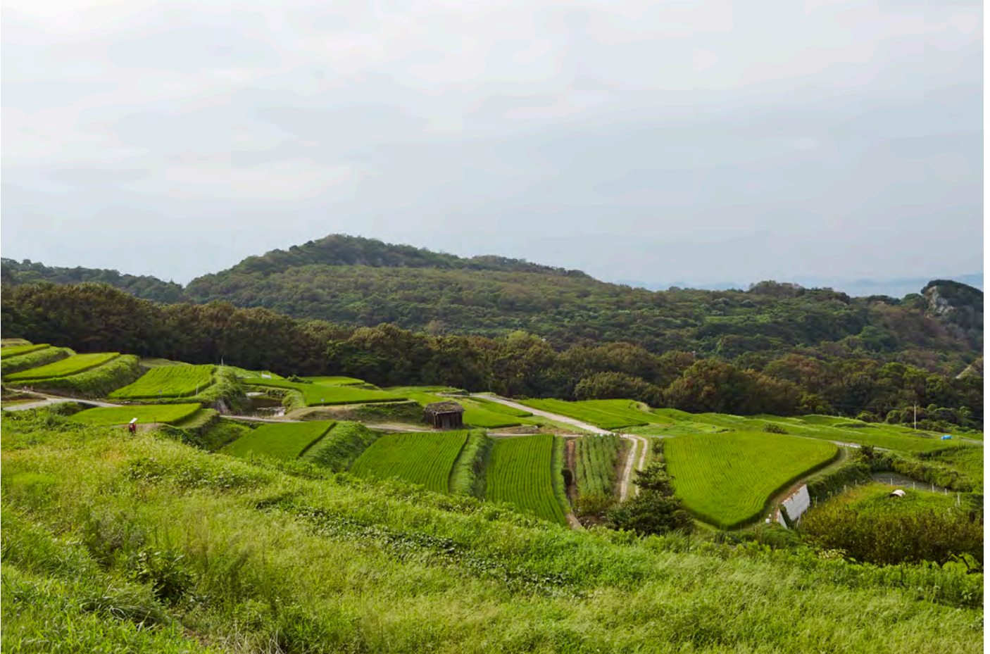
Fig. 39 Rice terraces in Teshima.

Even though the Setouchi Triennale has increased footfall on the Setouchi islands, the problem of ecological sustainability is looming large on the horizon. Choices may have to be made in the near future. There is a dilemma between preservation, the possible regression to earlier ways of living, or progress/change towards an unknown future with no definite promise of a happy ending.