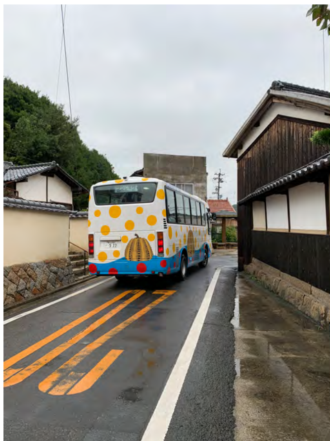
Fig. 23 The Naoshima town bus with cheery Kusama-inspired polka-dots and pumpkins on the narrow roads, threading through the old Japanese houses.