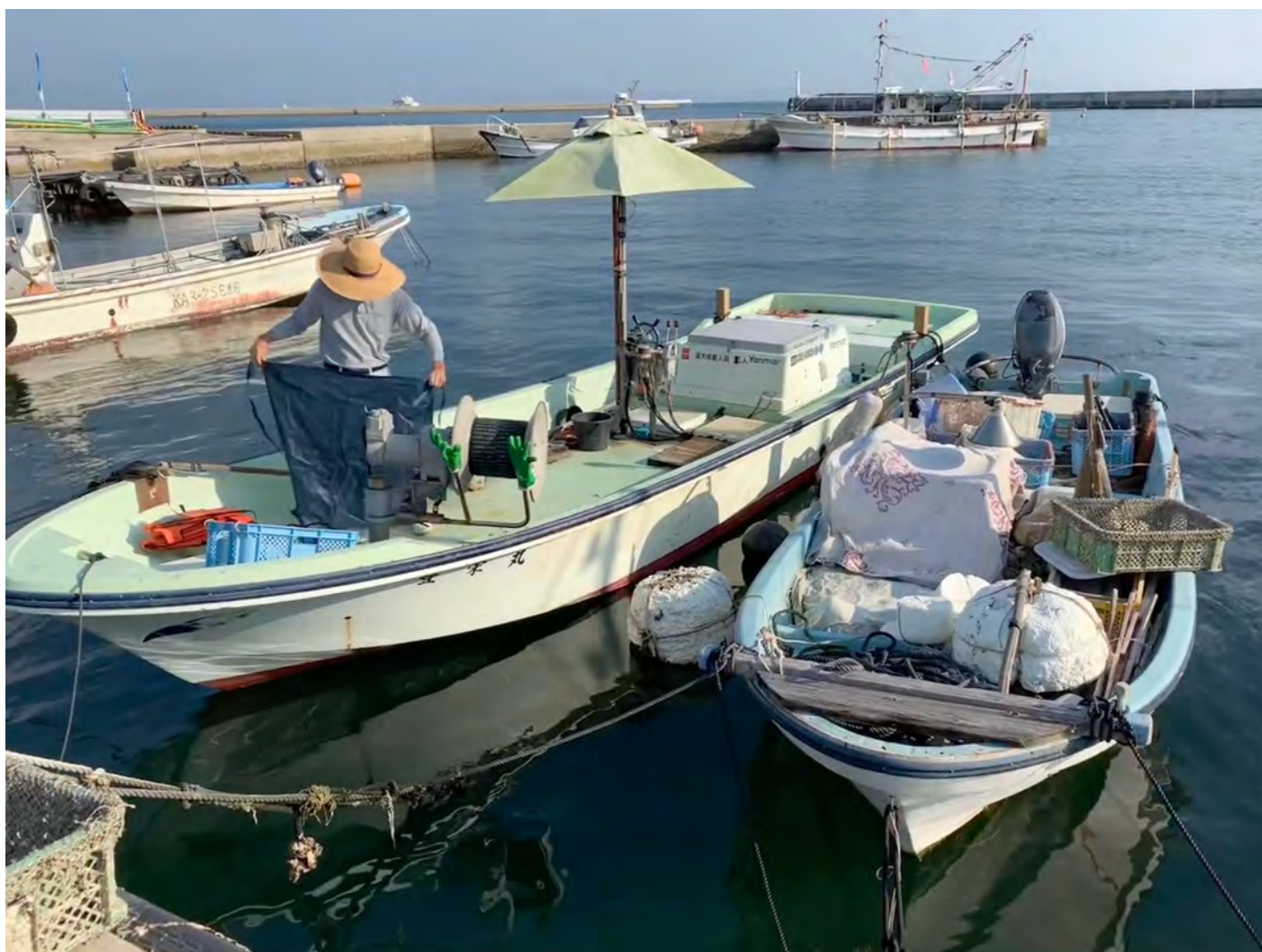
Fig. 41 A fisherman getting ready to set off for a day's work. Boat docked at Karato Port, Teshima.

On the islands of Naoshima, Shodoshima, Ogijima and Inujima, which have had some success in attracting young families with children, education and healthcare needs will be of growing importance in the future. The urban-rural migration that has led more young people, including Koebi-Tai volunteers from other countries, to stay on will mean that more attention has to be given to needs beyond basic food and accommodation issues. It is not clear if these issues will be taken up at the prefectural government level or whether the Fukutake Foundation will review their human resource policies to support employees who decide to settle down on the islands and start families. Notably, the Mitsubishi's industrial activities on Naoshima has been an important factor in sustaining a stable population level that justifies the provision of certain amenities and services on the island.