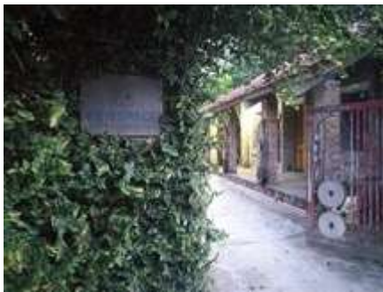
New Space Arts Foundation, Hue city, Vietnam