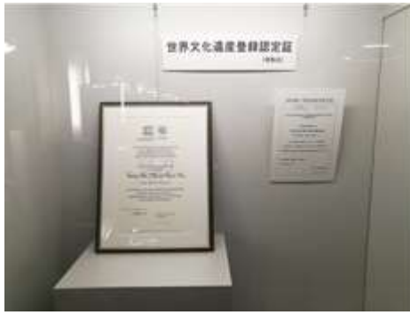
UNESCO added Tomioka Silk Mill to the World Heritage List