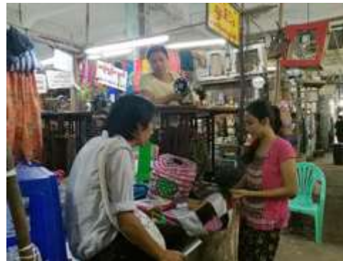
Working with local tailor in Yangon, Myanmar

In my point of view, even the Dawei SEZ mega-project was promoted that it would be the important western gateway of the southern economic corridor that link Vietnam, Cambodia and Thailand; in my perspective, we should much more concern about the living of people of Myanmar and also the environmental effect associated with economic zone. As like many other Southeast Asian countries, there is no strict environmental legislation in Myanmar.