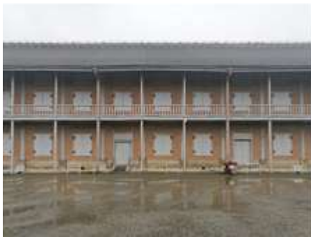
Tomioka Silk Mill, Gunma Prefecture, Japan

I have chosen to research in Gunma Prefecture because there is a historical site – Tomioka Silk Mill . Tomioka Silk Mill is the first large-scale silk-reeling factory in Japan that the Meiji government established in Gunma Prefecture in 1872 for the purpose of modernization. It was built as a model training facility in order to spread the skill of silk-reeling so that all the local silk mills would be able to mass-produce high-quality raw silk.