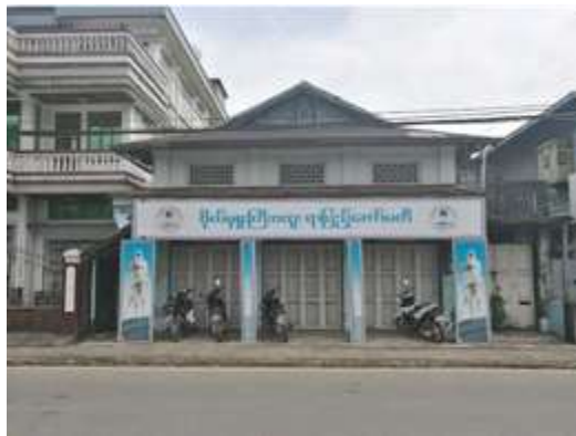
Dawei Township, Myanmar