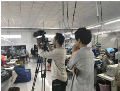
Shooting the documentary video in the garment factory in Cambodia