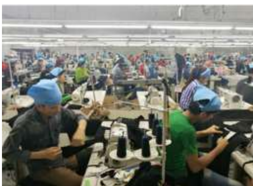
Garment workers working in the factory in Phnom Penh, Cambodia