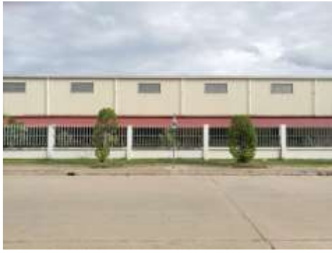
A factory in PPSEZ, Cambodia