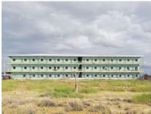
Worker dormitories near PPSEZ, Cambodia