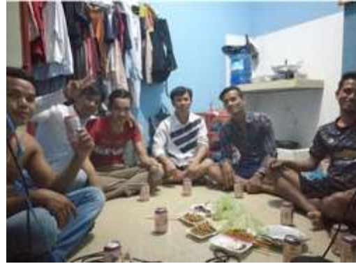
Hanging out with some workers in PPSEZ, Cambodia

In my perspective, the garment and apparel industry exemplifies the challenge associated with global manufacturing. There are many home-based garment workers who engage in the lower skilled work of ready-made garment production, low wages, “flexible” contracts and bad condition.