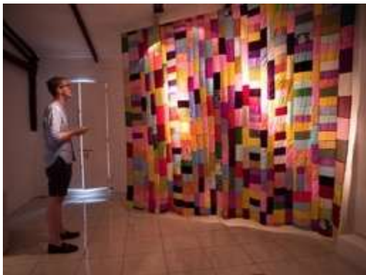
Open Studio at Sa Sa Art Projects, Phnom Penh

The last week of my residency, Sa Sa Art Projects organized my Open Studio to public audiences. I showed three pieces of patchworks which I collaborated with local home-based sewers and tailors, some video footages which were filmed by some garment workers who work and live in Phnom Penh Special Economic Zone (PPSEZ) , photo documentations and Periodic Reports.