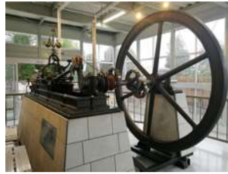
Full-scale replica of Brunat Engine