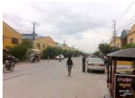
Canadia Industrial Park in Chak Ang-re area, Cambodia

In addition, amongst 34 special economic zones in Cambodia, there is Phnom Penh Special Economic Zone (PPSEZ) where is located on National Road No.4 in Khan Posenchey , suburb of Phnom Penh. PPSEZ is invested and run by Japanese investors since 2006. Regarding the information via their website, there are more than 10 garment, textile and apparel factories in PPSEZ.