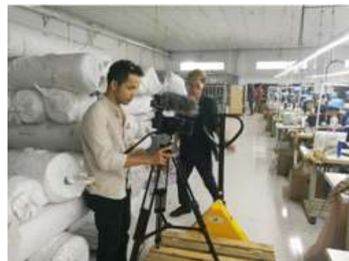
Shooting the documentary video in the garment factory in Cambodia