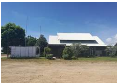
Sales Office in the Dawei SEZ project, Myanmar