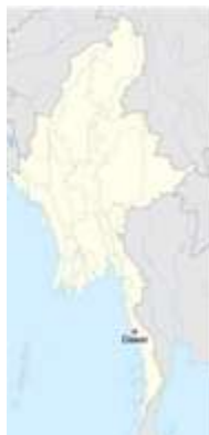
Location in Myanmar

The Dawei Special Economic Zone (Dawei SEZ) is an infrastructure mega-project in Myanmar. Thailand’s Italian-Thai Development (ITD) initiated the project in 2008, but it eventually suspended in 2013, since ITD was unable to raise the necessary funds. However, the governments of Myanmar and Thailand have continued to promote the project.