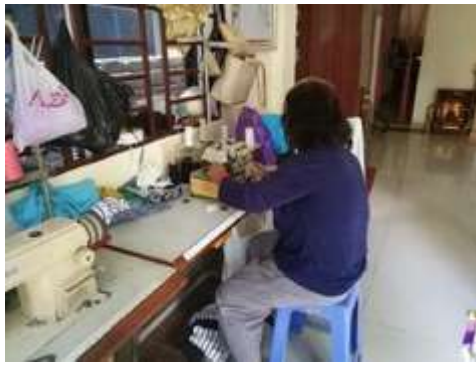
Working with local home-based sewer in Phnom Penh