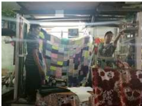
Working with local tailor in Yangon, Myanmar

Regarding this part, I let the local home-based sewer and tailors created patchworks from the fabric remnants that I brought from Cambodia without directing. I let them to create the patchworks as their styles.