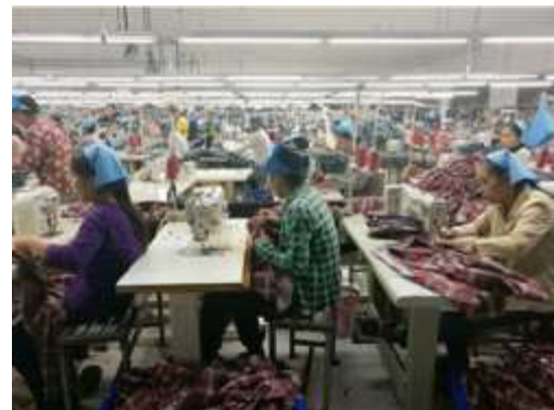
Garment workers working in the factory in Phnom Penh, Cambodia

Moreover, I also asked some garment workers who work and live in Phnom Penh Special Economic Zone (PPSEZ) to collaborate with this project. In this part, I asked the garment workers to film video clips about their ordinary lives outside factories from their smart phones. As usual, I just told them what I want and after that I let them to film video clips as they style without directing.