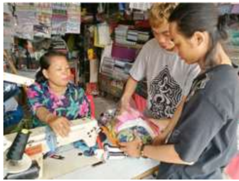
Working with local tailor in Phnom Penh

I have also been made the experimental video documentary by collaboration with a local freelance photographer and Cambodian garment workers.