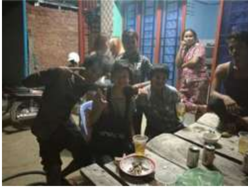
With some garment workers in PPSEZ, Cambodia