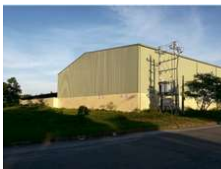
Phu Bai Industrial Zone in Thua Thien-Hue province, Vietnam