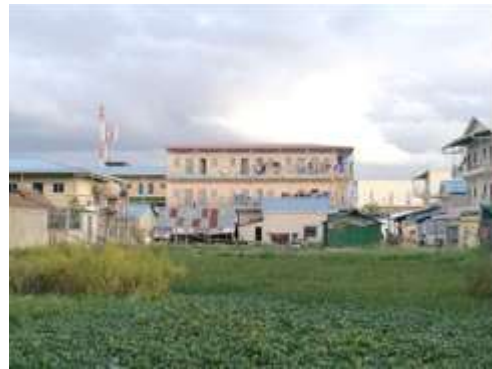
Worker dormitory near PPSEZ, Cambodia

In Phnom Penh Special Economic Zone (PPSEZ), many workers especially single women live in worker dormitories where are situated in the factories, and many of them especially workers who are couples or have families live near the area.