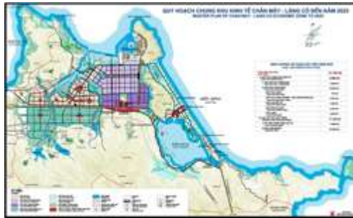
Master plan of Chan May – Lang Co Economic Zone to 2025

After researching, I went to Cho Dong Ba market in Hue city to find local sewers and employed them to create textile patchworks from fabric remnants which I brought from the garment factories in Thailand. Regarding this part, I let the local sewers create patchworks as their styles without directing.