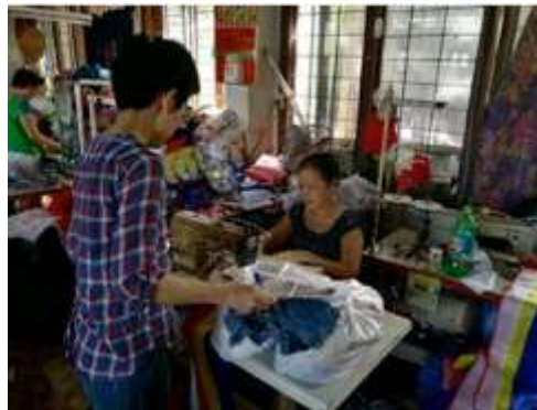
Collaborative art making with local sewers in Vietnam

In my point of view, even the cost of living in Thua Thien-Hue province, Vietnam is inexpensive; however, it seems that the living wage of factory workers here is not enough. In addition, Thua Thien-Hue province will have a mega-project of Chan May – Lang Co Economic Zone around Chan May Bay in 2025. Personally, apart from the exploitation