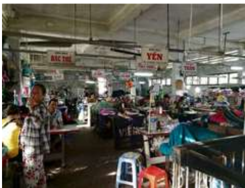
At Cho Dong Ba market in Hue city, Vietnam

After researching, I went to Cho Dong Ba market in Hue city to find local sewers and employed them to create textile patchworks from fabric remnants which I brought from the garment factories in Thailand. Regarding this part, I let the local sewers create patchworks as their styles without directing.