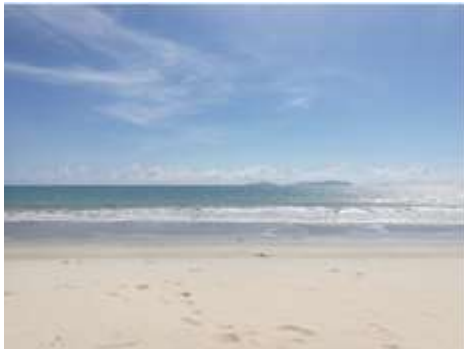
The Dawei deep-sea port project, Myanmar

Dawei SEZ purposes to transform Dawei into Myanmar's and Southeast Asia's largest industrial and trade zone. If this megaproject completed, it will be the largest industrial zone in Southeast Asia.