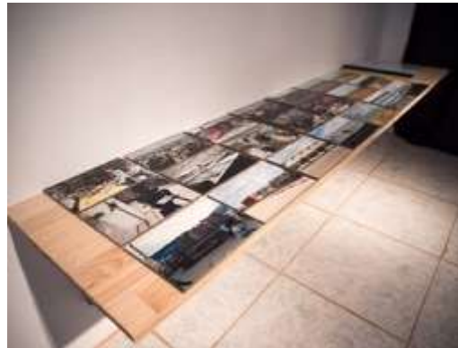
Open Studio at Sa Sa Art Projects, Phnom Penh