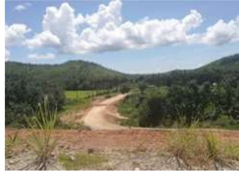
Interviewing local people living in Dawei SEZ project Construction of roads for the SEZ have caused many environmental problems

Website Dawei Special Economic Zone: http://www.daweindustrialestate.com