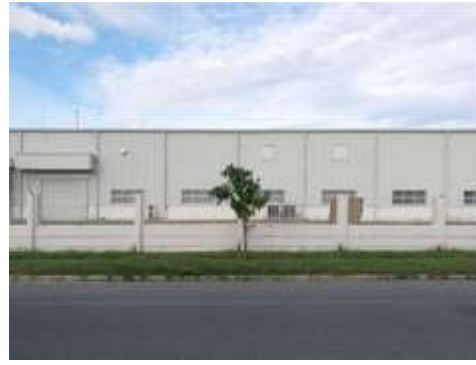
A factory in PPSEZ, Cambodia