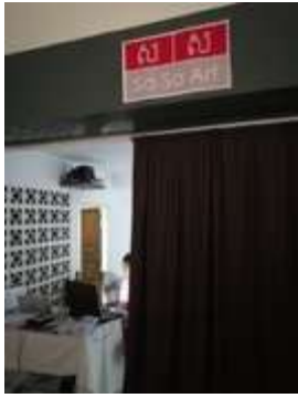
Sa Sa Art Project, Phnom Penh, Cambodia