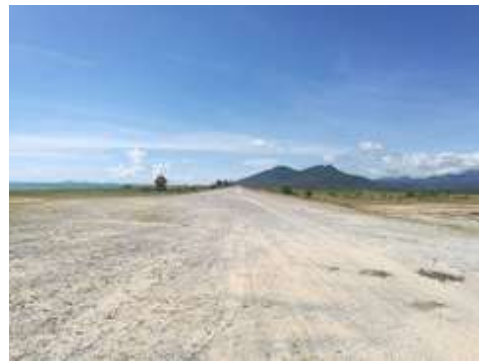
The Dawei SEZ project, Myanmar