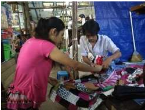
Working with local tailor in Yangon

During my research in Myanmar, Beyond Pressure supported me the translator and assistant in order that I could accomplish my plan.