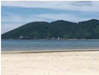
Chan May Port at Chan May Bay in Vietnam has been expanding

Website Chan May — Lang Co Economic Zone: http://chanmaylangco.com.vn/Homepage