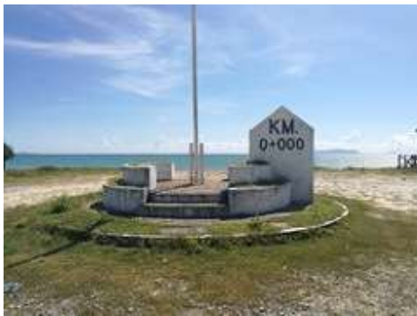
The Kilometer Zero in the Dawei SEZ project, Myanmar