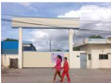
Vattanac Industrial Park in Stung Meanchey area, Cambodia

In Chak Ang-re area on National Road No.2, there are many fragment garment factories on both sides of the main street with some small markets. Workers live just off the main street inside the alley.