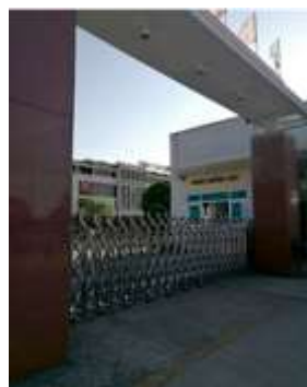
Hue Textile Garment Joint Stock Company in Thua Thien-Hue province, Vietnam

Phu Bai Industrial Zone is located in Huong Thuy district near Phu Bai airport, providing jobs in many industries for thousands of employees. Due to the high success of the industrial zone, many textile and garment companies located in the zone had expressed their willingness to expand their factories.