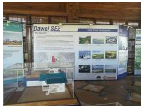
Inside Sales Office, the Dawei SEZ project

In 2015, the Government of Japan formally became involved in the Dawei SEZ project. Japan invests through the Japan Bank for International Cooperation (JBIC) through a Special Purpose Vehicle that provides investment in an equal ratio to that of the Myanmar and Thai governments.