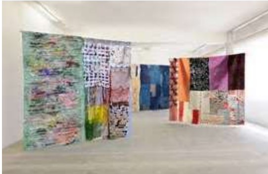
Sketch drawing of installation view in the exhibition

I also plan to publish exhibition catalogues that consist of articles written by a curator and an intellectual specialized in social science. During the exhibition, I plan to organize exhibition talk by inviting a specialist in the issues in order to share and exchange ideas with general audiences.