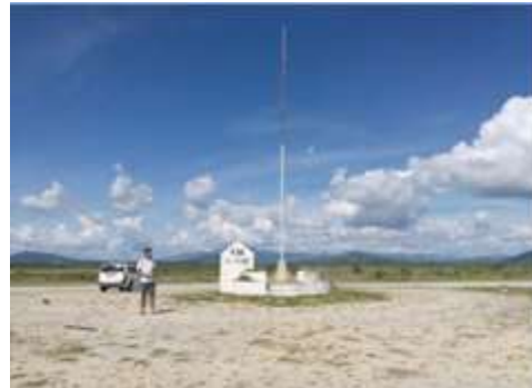
The Dawei SEZ project, Myanmar