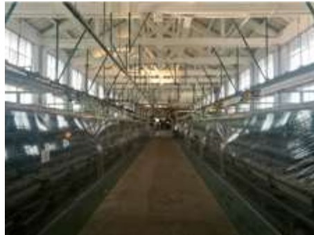
Silk-reeling Plant in Tomioka Silk Mill, Japan

The Meiji government invited French advisers to Japan as France was a superior country in reeling silk at that moment. Mill hands were also recruited from all over Japan. Eventually, other silk mills were established throughout the country after Tomioka model and some mill hands who had learned the newest silk reeling techniques at Tomioka Silk Mill played active and important roles at the silk mills in their hometowns.