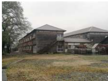
Female Workers' Dormitory in Tomioka Silk Mill, Japan

With other three silk industrial heritages in Gunma Prefecture, in 2014, Tomioka Silk Mill was selected to be the one of a UNESCO World Heritage Site.