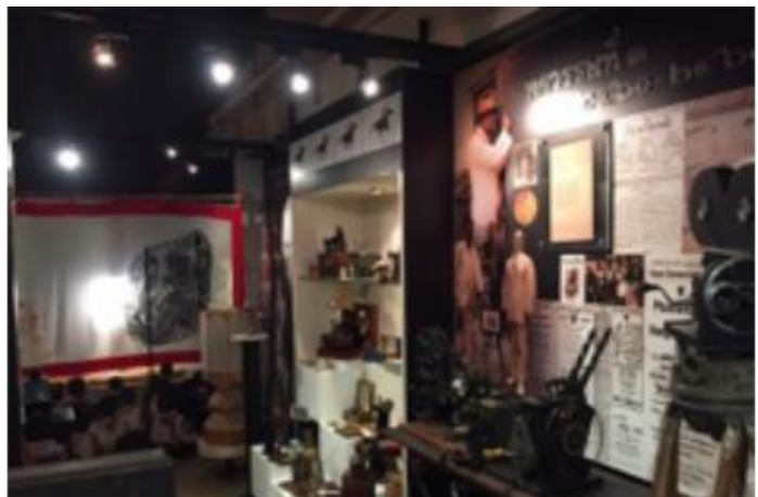
▲Various materials concerning Thai film history